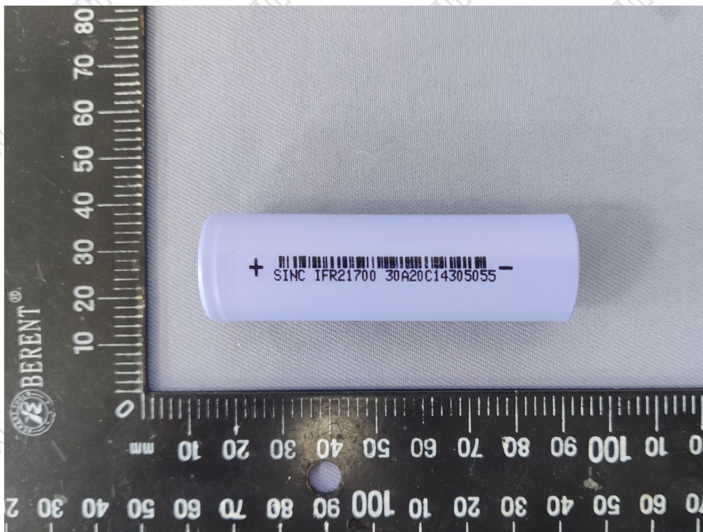
Figure 4 Overall view of cell (电芯图)