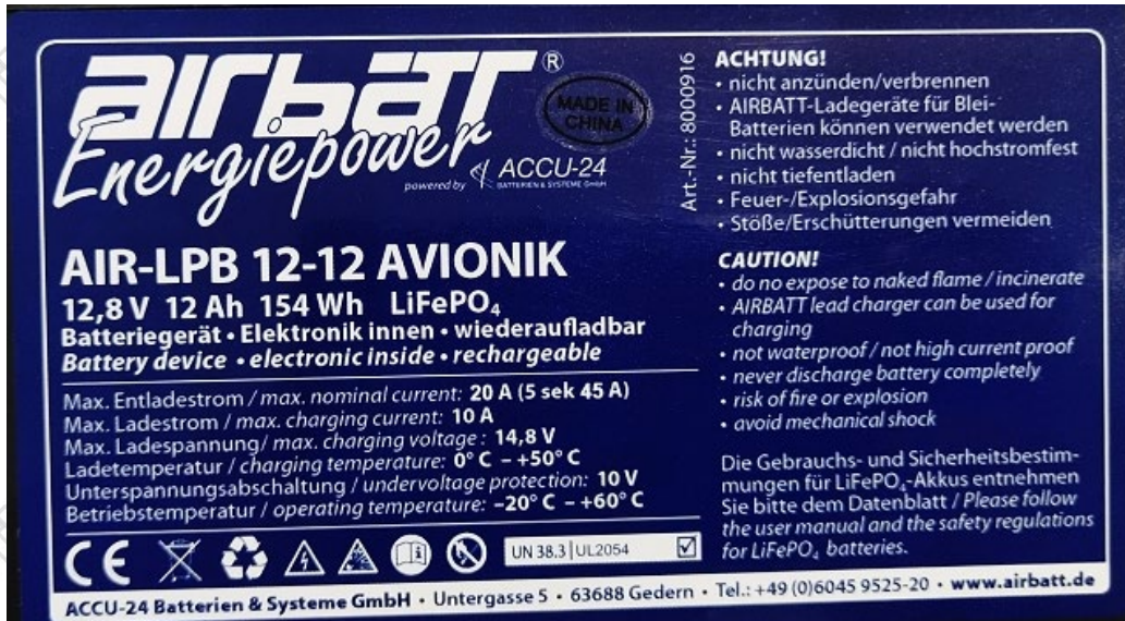
Figure 3 Battery Label (标签)